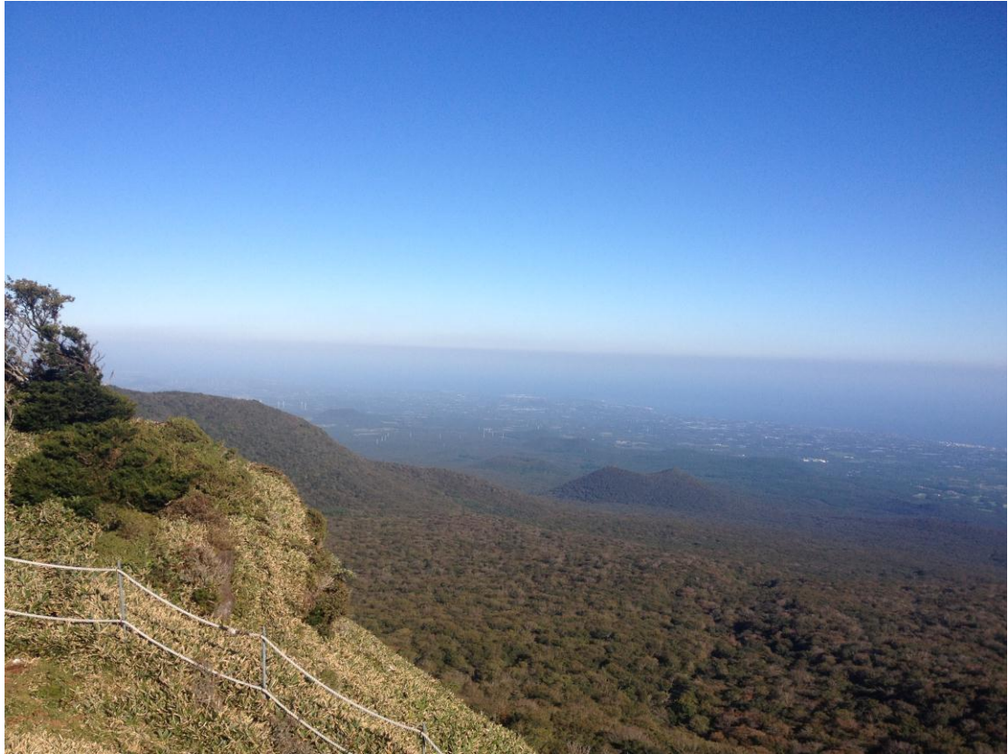
Hallasan mountain, Jeju Island