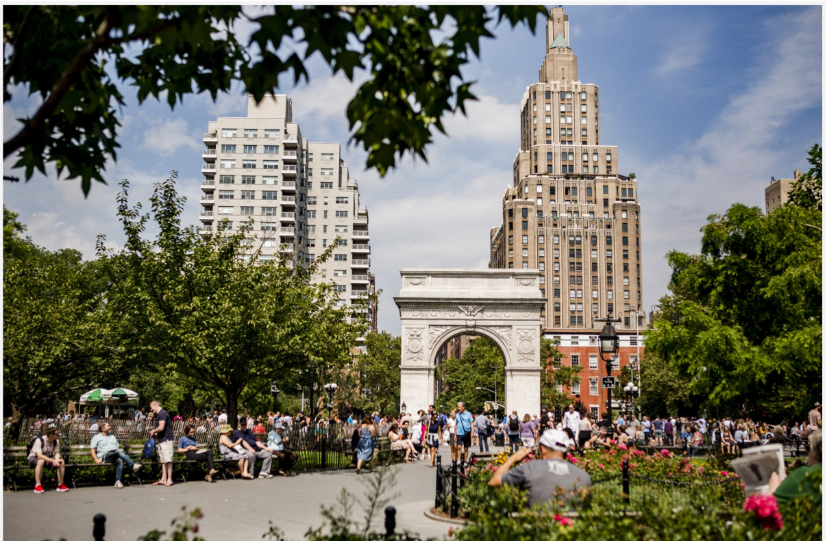
Washington Square Park

There are 60-70 students in most MBA electives.