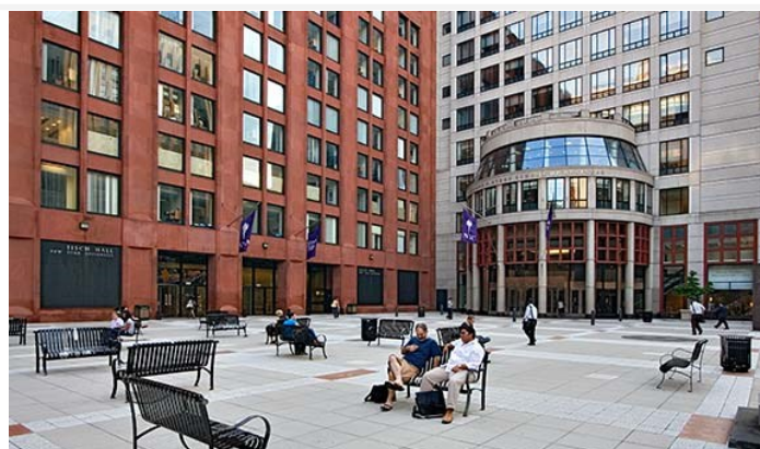
The Kaufman Management Center at NYU Stern