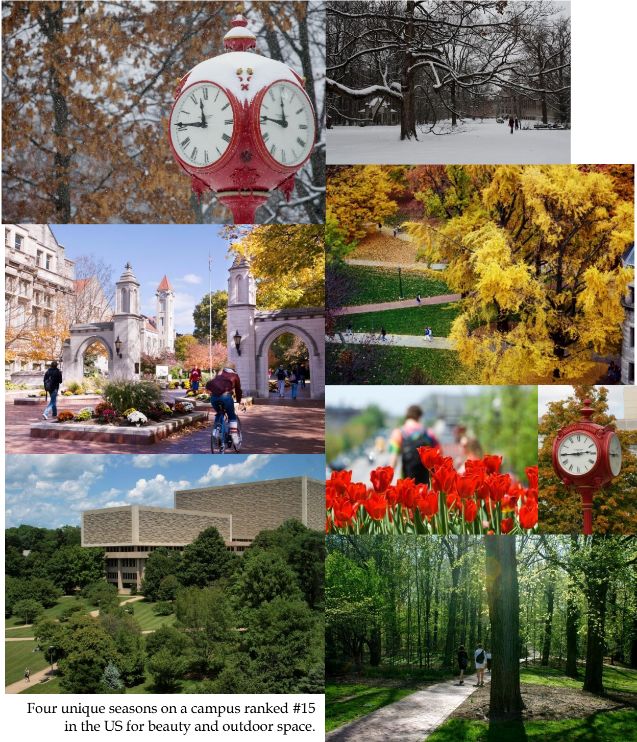
Four unique seasons on a campus ranked #15 in the US for beauty and outdoor space.