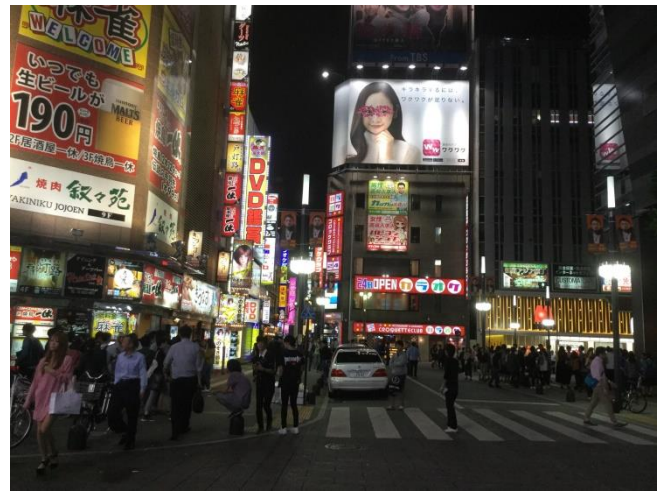
Nagoya city at night