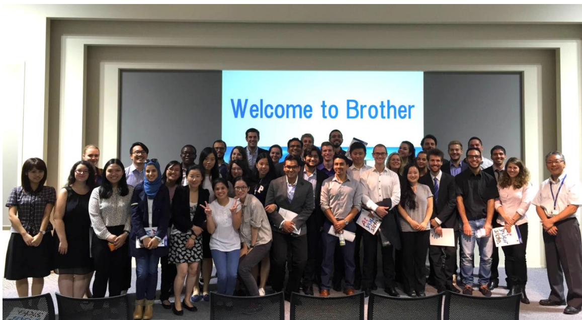
Visit at Brother