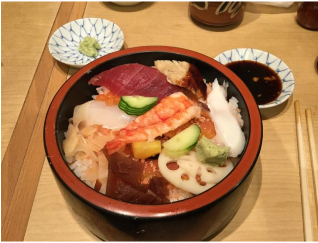
One of the meals