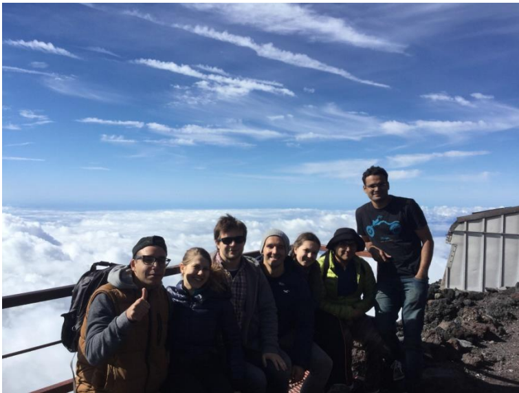
Trip to Mt. Fuji