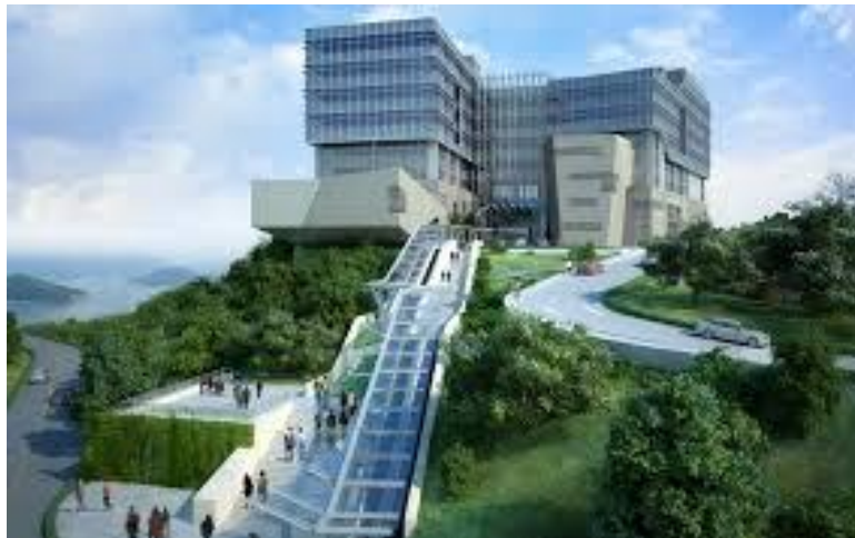
*The HKUST business school

HKUST has an absolutely amazing (main) campus in a beautiful location with State of the Art facilities. Note, HKUST is located an hour from Hong Kong island.