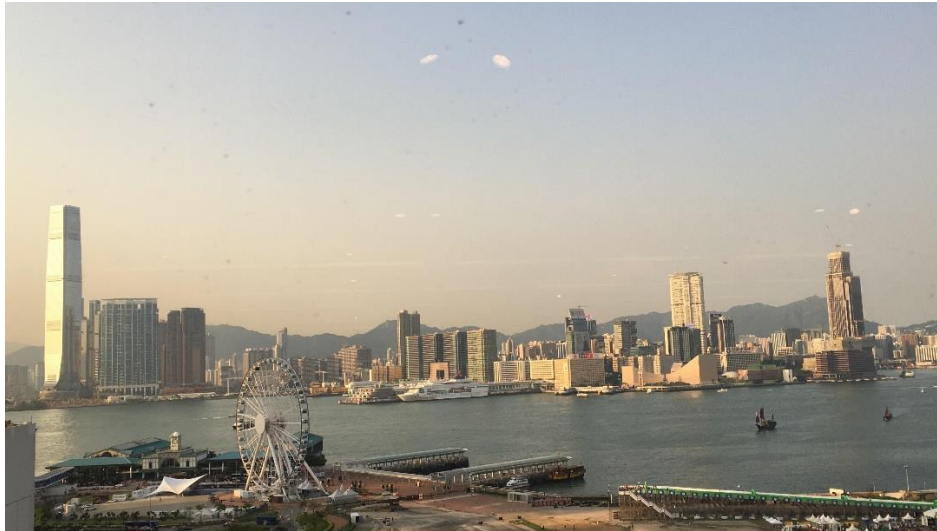
*pic from the Central campus

In addition, HKUST holds another “Central” campus. This campus has beautiful classrooms which are located in a building next to the central MTR station.