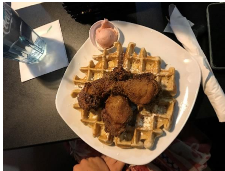
Chicken & Waffle – Downtown Durham