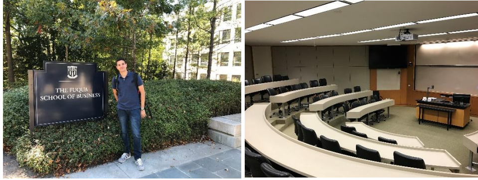
First day of school