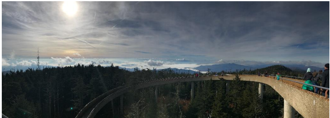
Great Smoky Mountains National Park