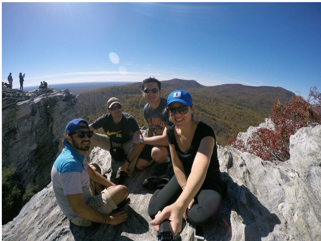
The Looking Glass (about 2 hours from Durham)