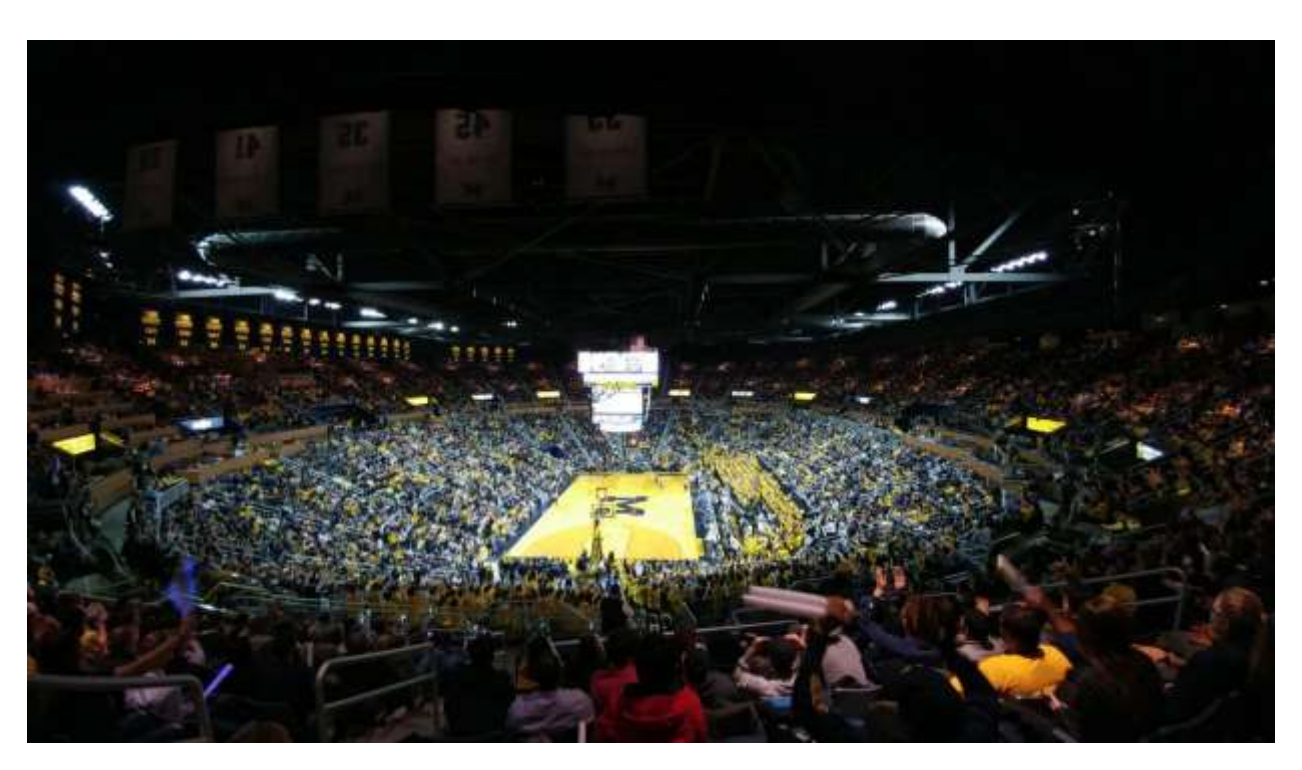
The basketball hall